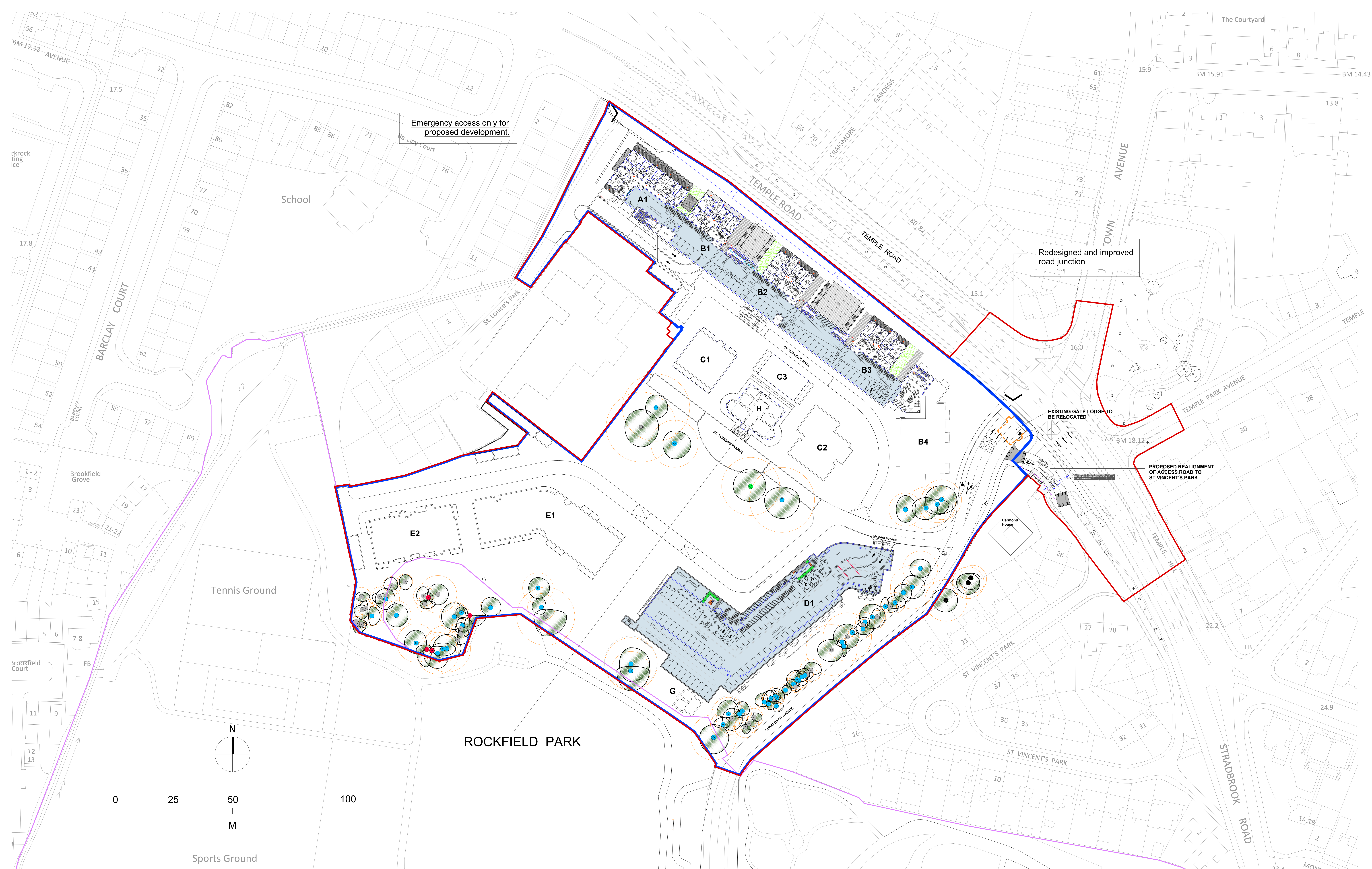
PROPOSED MASTER SITE LAYOUT PLAN - BASEMENT B AND D